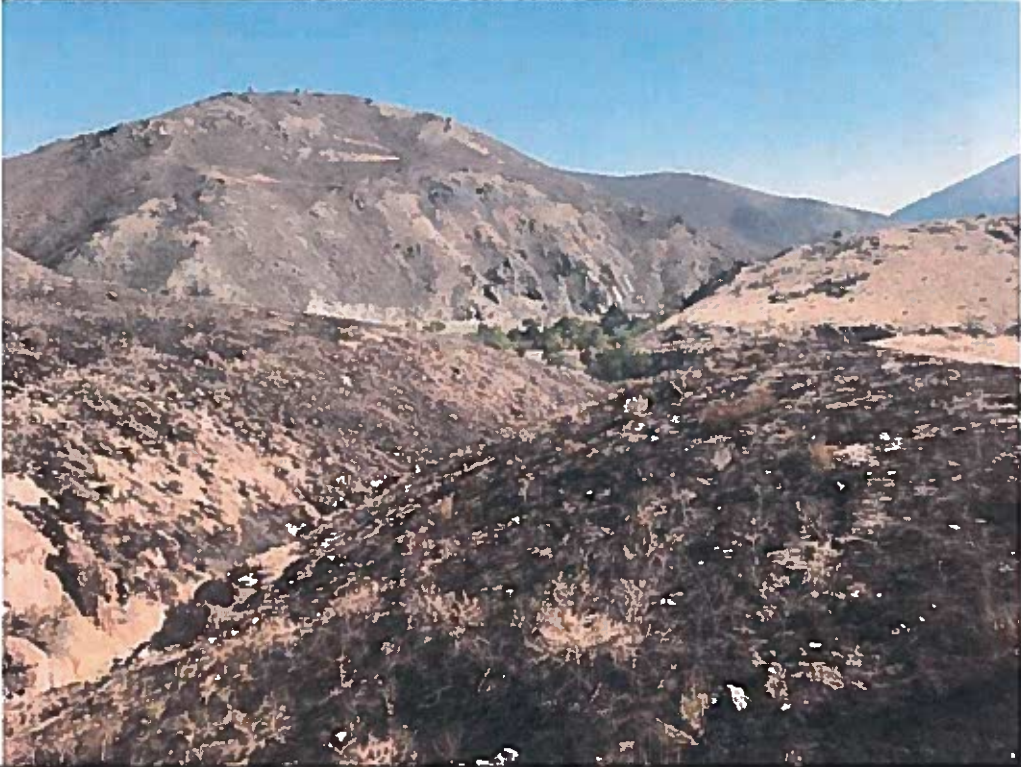
Photograph 2. Carson River Canyon, Rifle Range Fire site - September 2018.