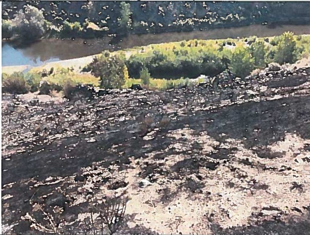
Photograph 4. Carson River Canyon, Rifle Range Fire site - September 2018.