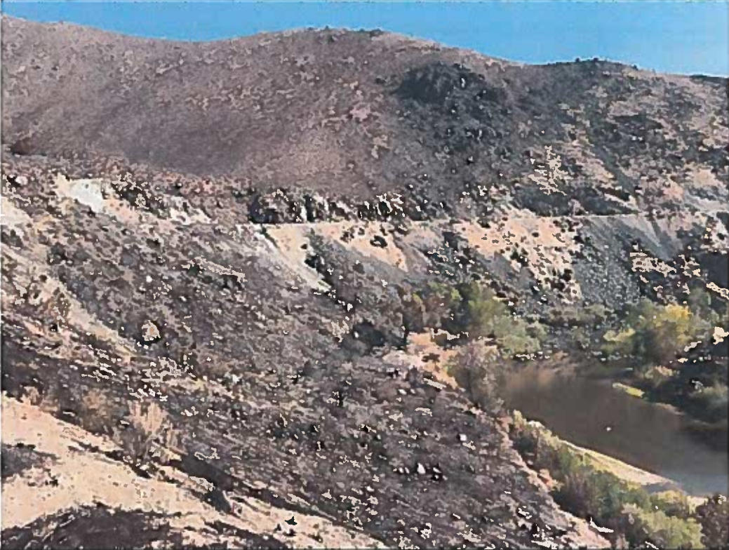
Photograph 1. Carson River Canyon, Rifle Range Fire site - September 2018.