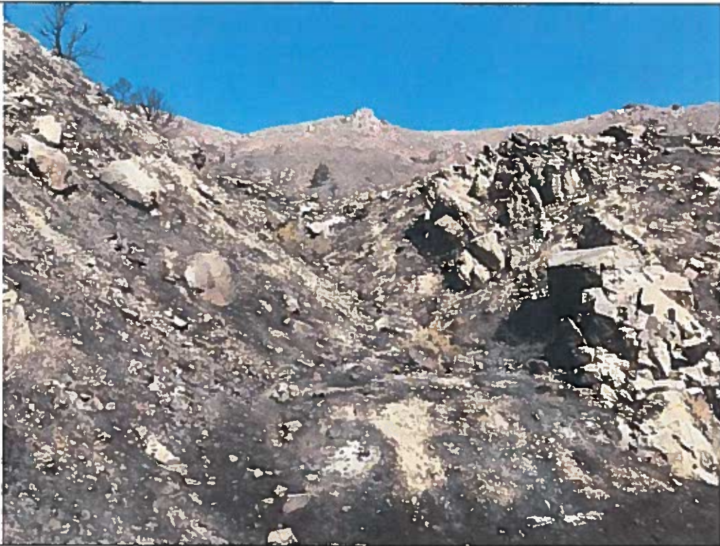
Photograph 3. Carson River Canyon, Rifle Range Fire site - September 2018.