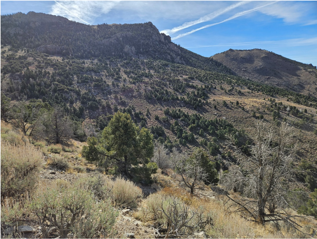
Phase 2 will likely be thinned rather than complete tree removal.