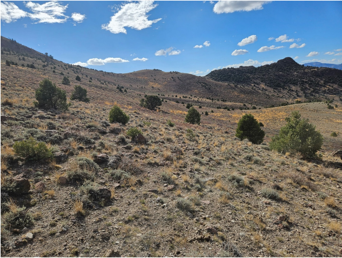
Representative area of Phase 1 encroachment.