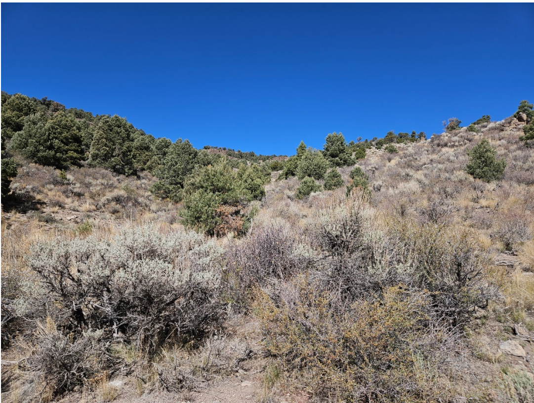
Representative area of pinyon and juniper encroachment into mountain shrub communities.