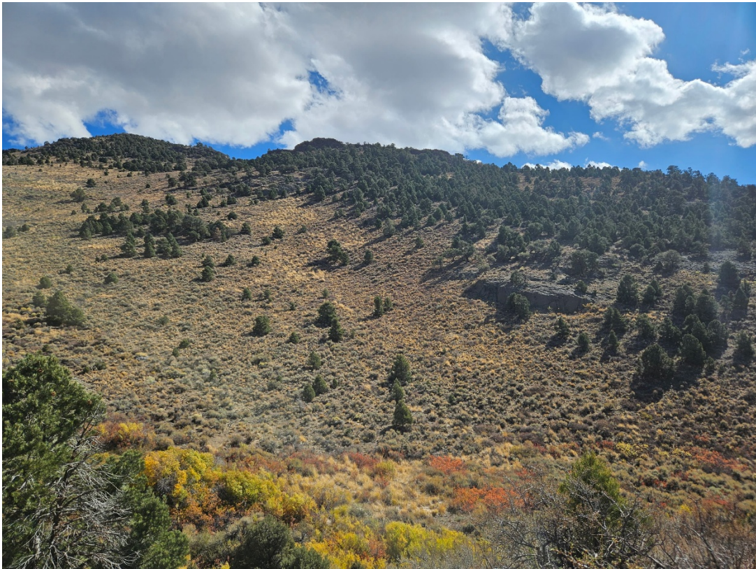
Representative area of Phase 1 encroachment, with Phase 2 on the edges. Phase 2 will likely be thinned rather than complete tree removal.